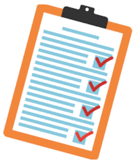
LSUP test compared to clinical conclusion